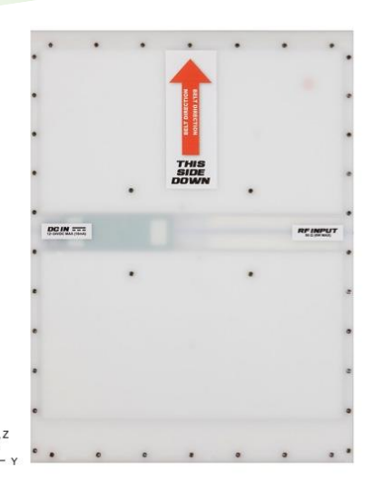
The SlimLine A6015

Ultra-low profile circular polarised antenna